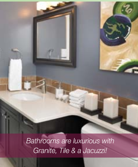
Bathrooms are luxurious with Granite, Tile & a Jacuzzi!