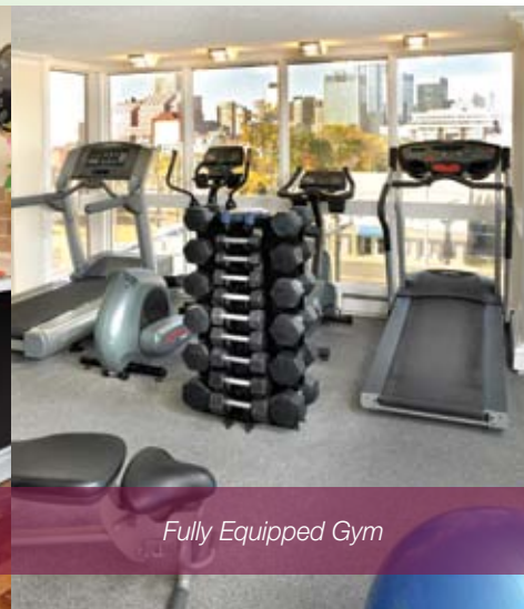
Fully Equipped Gym

Cindy Whittingham 780.483.9583 tdk-inc@telus