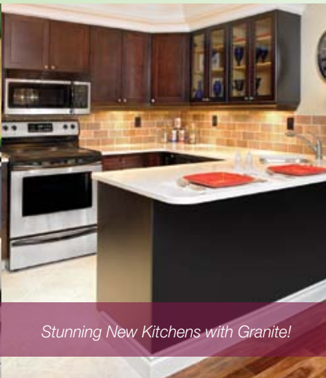
Stunning New Kitchens with Granite!